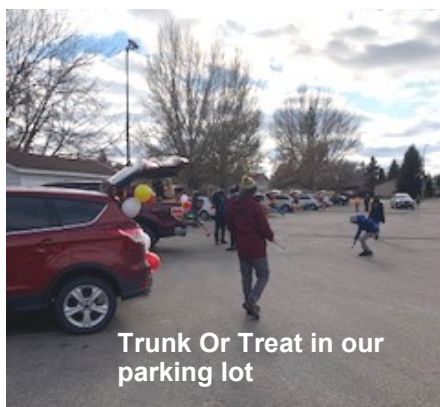
Trunk Or Treat in our parking lot