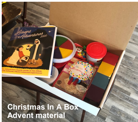
Christmas In A Box Advent material