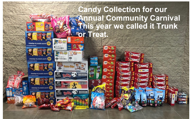
Candy Collection for our Annual Community Carnival This year we called it Trunk or Treat.

It is impossible to discuss the ministry to families at Cornerstone without highlighting the very hard